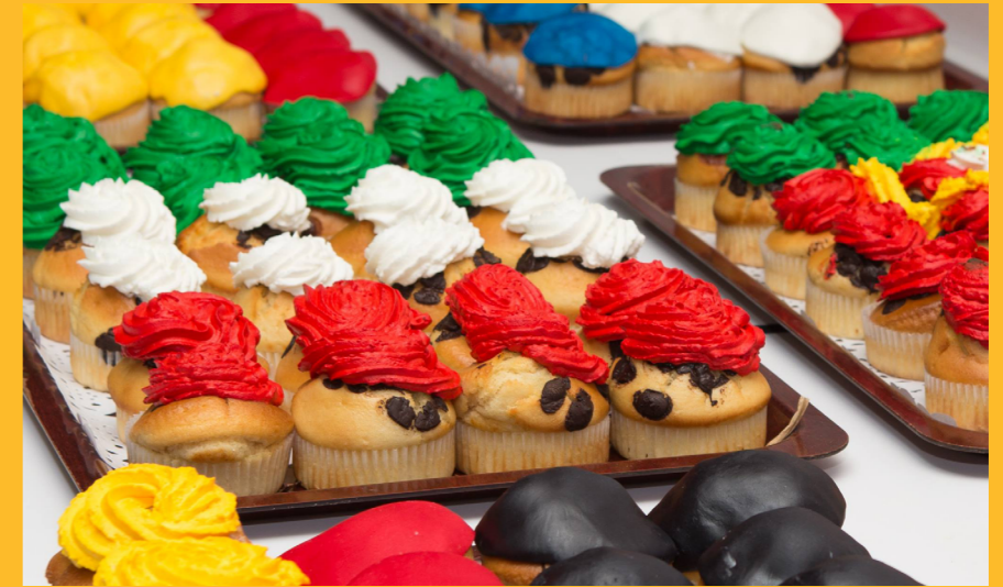
May & December Cultural Food Fair

Cultural Food Fair May & December Cultural night has been going almost as long as Les Roches. It's an amazing experience - a feast of the different cultures represented on campus. There's dance, music, color and, of course, delicious international cuisine.