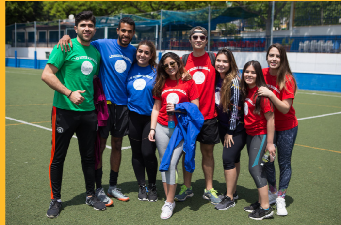
April & October Houses Sports Day

Houses Sports Day April & October Each semester, Les Roches Marbella hosts the Houses Sports Day where students, staff and Faculty gather together in different sport activities and competitions.