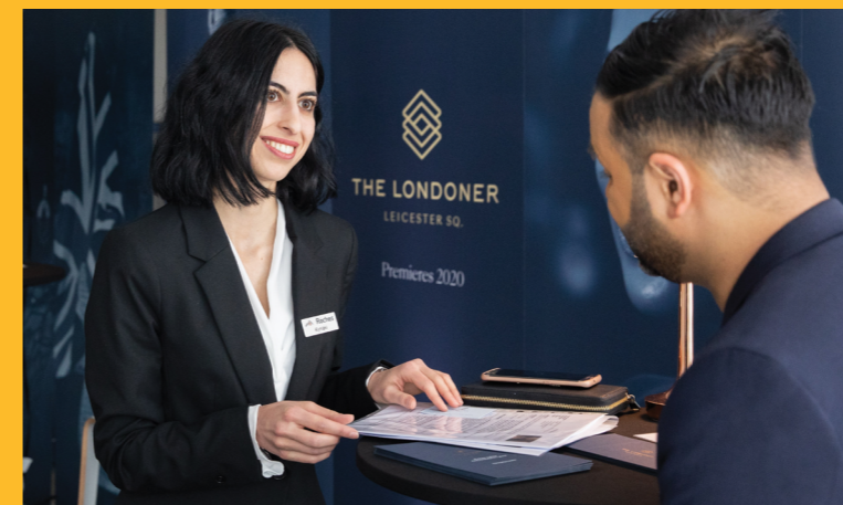
All year round Industry Presentations

Industry Presentations All year round At Les Roches Marbella we host different Industry Visits throughout the year. More than 80 international companies from all hospitality and experience economy sectors - retail, luxury, travel, tourism, real estate, digital & experiential - come and recruit Les Roches students. Students from all programs will join, looking for internships, management trainings, jobs or even management positions.