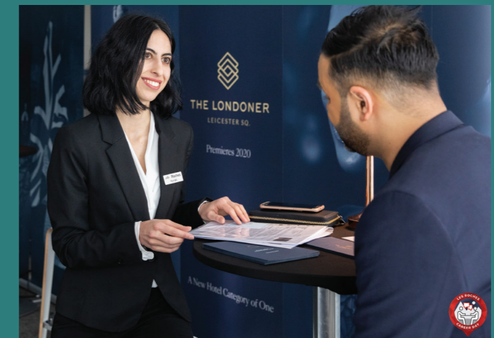
Spring & Autumn