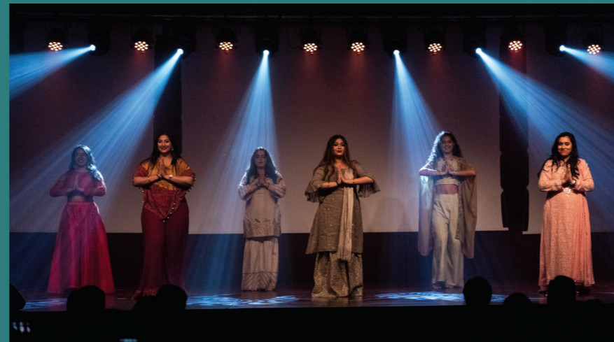
Spring & Autumn