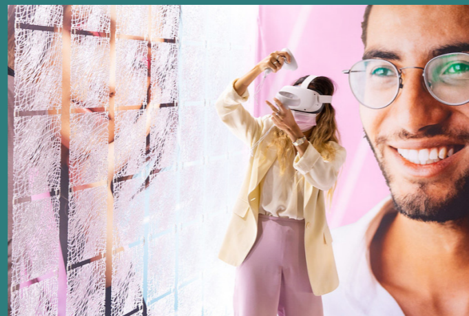
Spring & Autumn