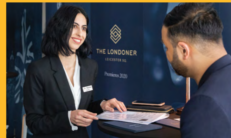
All year round Industry Presentations

Industry Presentations All year round At Les Roches Marbella we host different Industry Visits throughout the year. More than 80 international companies from all hospitality and experience economy sectors - retail, luxury, travel, tourism, real estate, digital & experiential - come and recruit Les Roches students. Students from all programs will join, looking for internships, management trainings, jobs or even management positions.