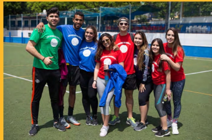
April & October Houses Sports Day

Houses Sports Day April & October Each semester, Les Roches Marbella hosts the Houses Sports Day where students, staff and Faculty gather together in different sport activities and competitions.