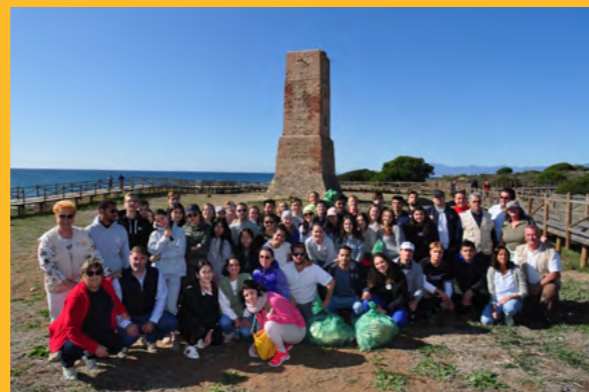
All year round Volunteering activities

Volunteering Activities All year round For many years, Les Roches Marbella has been actively present in different social actions, volunteering services, donations towards the local community. We coordinate present actions, promote activities and listen to new initiatives and needs in the community. We will be a one stop point for any information regarding volunteering actions in the area and to help our community at Les Roches Marbella to develop our common goals and ideas, such as volunteering services, food collection, elderly centers invitations, circular zero-waist policy, etc.