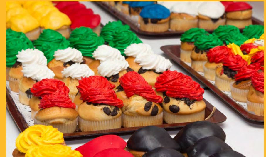
May & December Cultural Food Fair

Cultural Food Fair May & December Cultural night has been going almost as long as Les Roches. It's an amazing experience - a feast of the different cultures represented on campus. There's dance, music, color and, of course, delicious international cuisine.