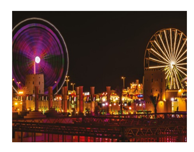
Shaikh Zayed - Heritage Festival