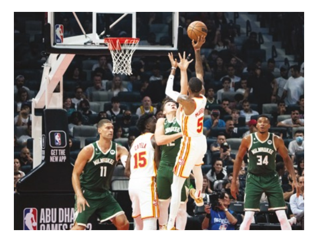
NBA in AbuDhabi -Etihad Arena

Showcases films from around the world, promoting regional and international cinema.